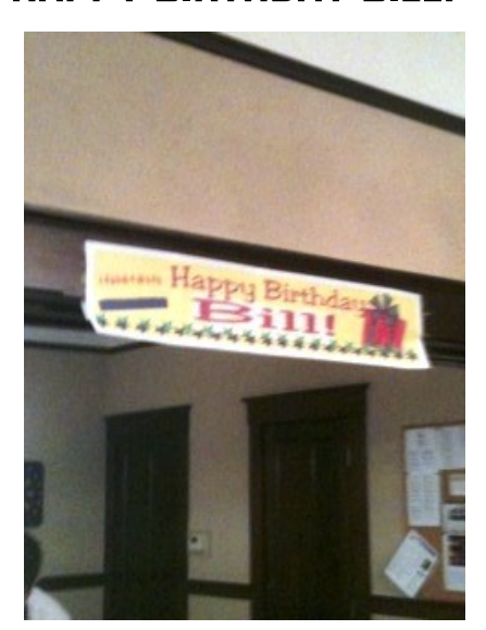
Birthday Sign in Dining Room